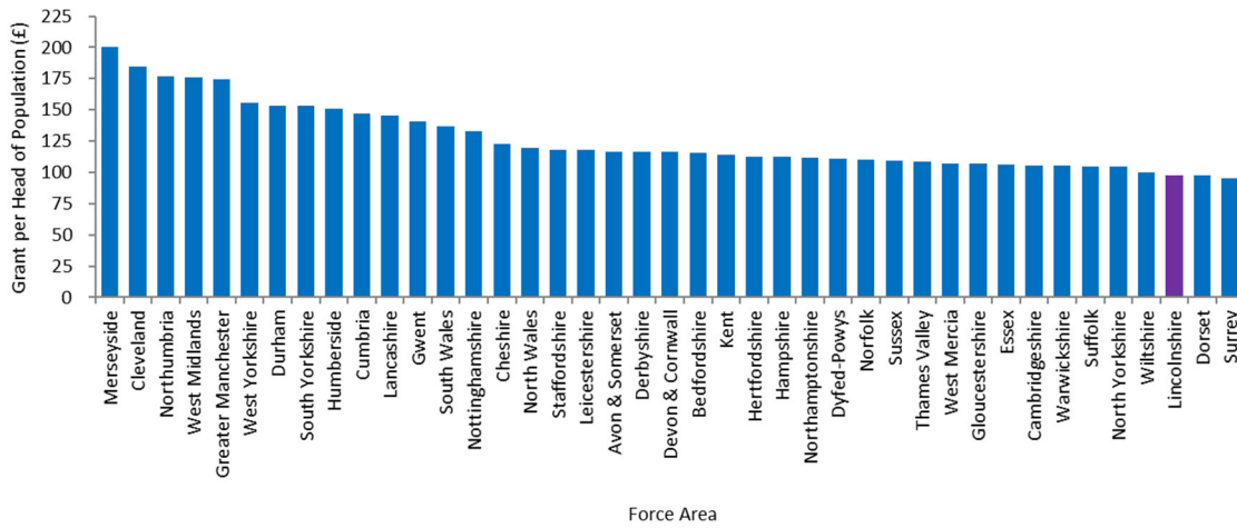
Figure 2: Formula Grant per Head of Population (2021/22)

Welsh Forces receive additional Top Up Grants included above. Includes Legacy Council Tax Grants. Excludes Pension Top Up Grant and Ringfenced PUP Grant. Excludes the City of London and Metropolitan Forces.